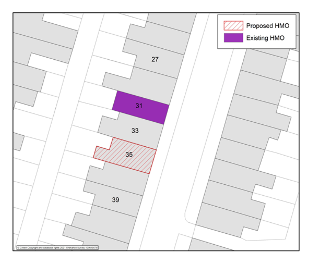
Figure 3.2 Restricting the sandwiching of property No. 33.